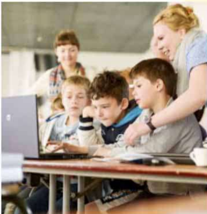
Intergenerational workshop in Paris, 2016