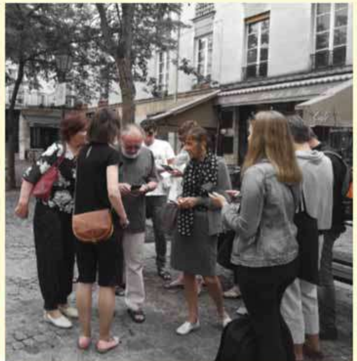
Digital treasure hunt in Paris, 2018